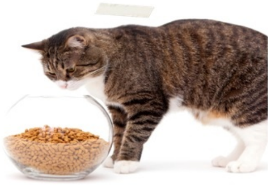
xiǎo māo chī fàn 小猫吃饭。